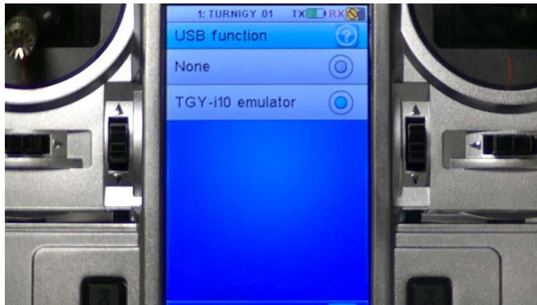
Picture 10: The default USB-mode is "None" - therefore the radio won't appear on your computer while connecting it to the USB. You need to find this setting in the menu and set it in "TGY-i10 emulator" mode.